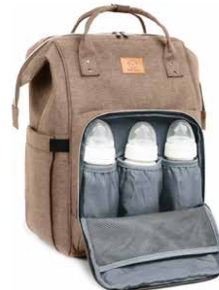
● KeaBabies Original Diaper Backpack is available in one of the season's hottest colors — coffee brown. Plus, it's thoughtfully designed with multiple pockets and compartments, including one for your cell phone, to help you stay organized. The gender-neutral styling is perfect for parents who want to share a diaper bag. keababies.com