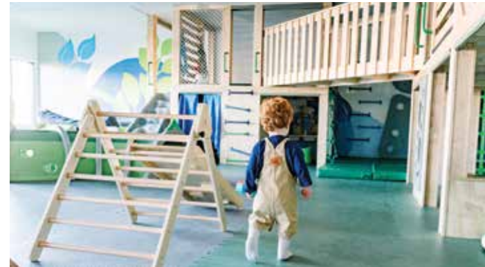
The Playroom East Cobb

This indoor playground has a soft play area with swings, slides and a ball fountain, along with a high-tech art wall and imagination sandbox. The FUN Crawlers area has play structures for ages 2 and younger. Sandy Springs, readyssetfun.com