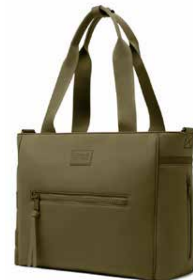
● Dagne Dover's Wade Diaper Tote is uber functional for the modern parent. It has a laptop sleeve, stroller clips, and diaper pad but looks like any other tote. It's available in some of the season's popular colors like olive green and mauve. Plus, the side zipper is handy for easy access to wipes. dagnedover.com