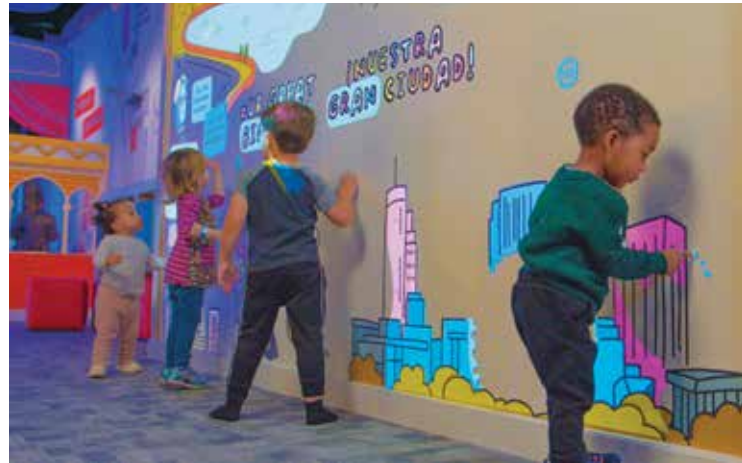
Atlanta History Center

These museums are anything but boring! With hands-on interactive exhibits, special events and places to explore, these spots are perfect for the younger set.