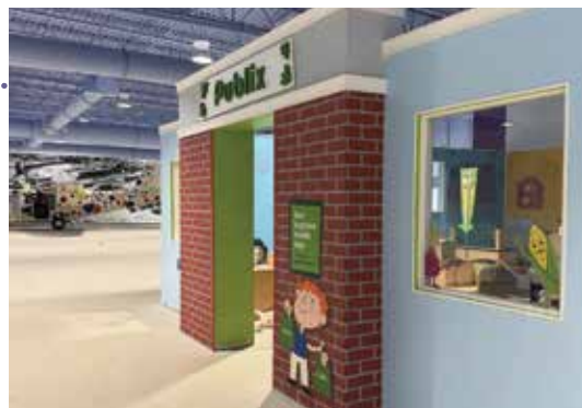
Interactive Neighborhood for Kids

A longtime kids' favorite, INK's new location in Oakwood has lots of spaces for kids to discover and explore. They can shop at the grocery store, visit the post office and Oliver's Diner, and act on the stage. There's even a "Preschool Paradise" for the smallest visitors. Check the website for storytime and crafting events. inkfun.org