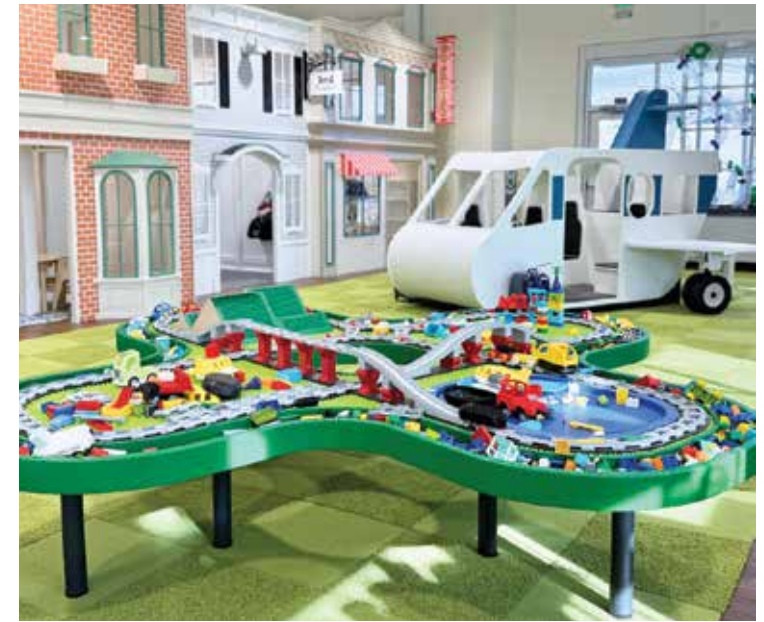
Play Street Museum

Explore city living on a kid-sized scale at a pretend café, doctor's office and fire station, along with blocks and plenty of soft places to play. Check their calendar for special events like kids' pottery painting and dino digs. Alpharetta, alpharetta.playstreetmuseum.com