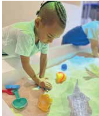
Ready Set Fun!

Designed just for ages 5 and younger, Little Leaf has open spaces for exploring, along with lots of toys to push and pull, climbing structures and more. Moms and dads can enjoy the coffee bar and connect with other parents, too. Woodstock, littleleafplaystudio.com