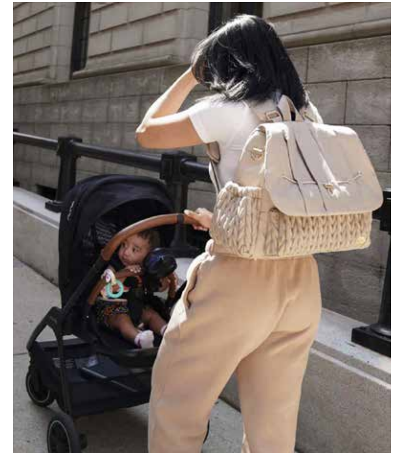
● The Levy Backpack by HAPP features a quilted design and is a neutral beige with gold accents. While the design is a touch more feminine than some of this season's finds, it's super stylish and the wide straps provide comfort for the parent wearing the bag. happbrand.com

In the handbag world, satchels and top handles are making a comeback. For a diaper bag that means a reliable form to hold all the baby gear along with a neat and elegant appearance. Opt for a bag with plenty of pockets and sections to keep things organized.