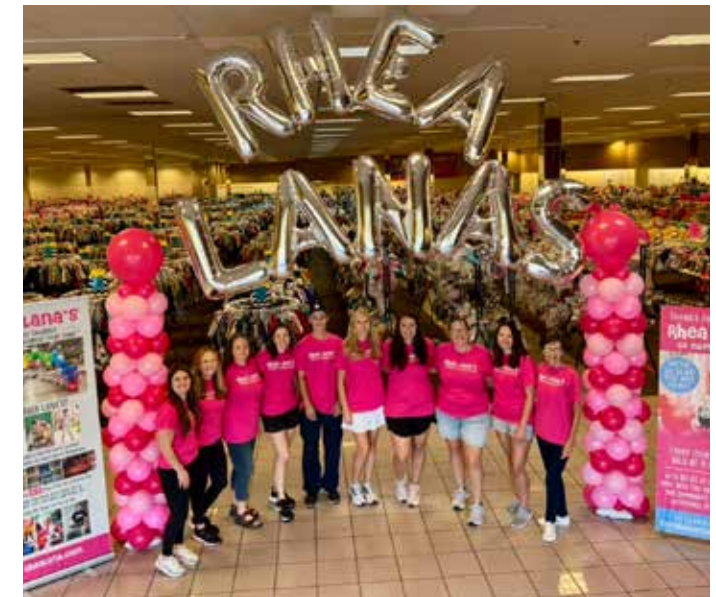
Rhea Lana’s of North Atlanta