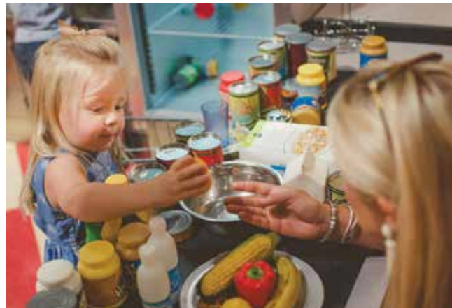
Children's Museum of Atlanta

Everything in this museum invites touching and exploring — no display cases or art behind glass here! At CMA, kids can play on a farm, shop for groceries and take a trip around the world. They can build simple machines, problem solve and visit a treehouse. Building Blocks Preschool Playtime for babies and toddlers includes Artsy Mondays, Tinkerin' Tuesdays, Messy Thursdays and Jam Session Fridays. Atlanta, childrensmuseumatlanta.org